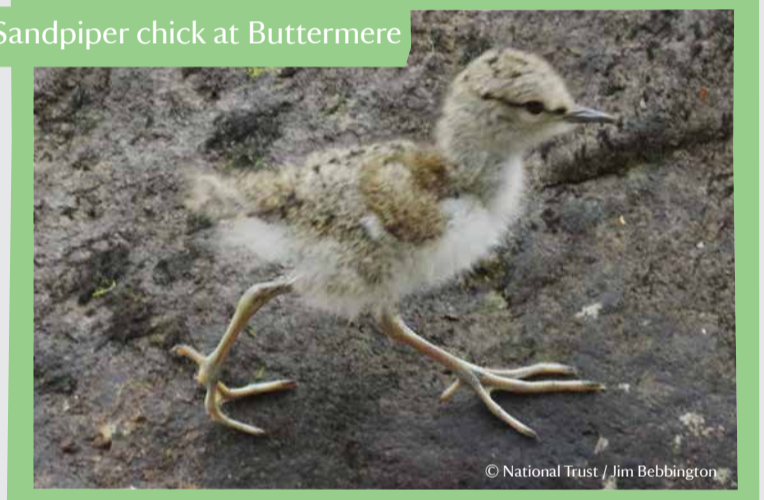
Sandpiper chick at Buttermere

Want a short circular walk from Buttermere village? We've created three temporary waymarked trails you could try.