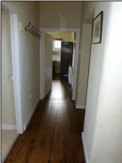
Corridor from sitting room