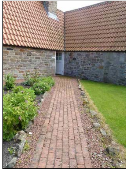
Path through garden at front