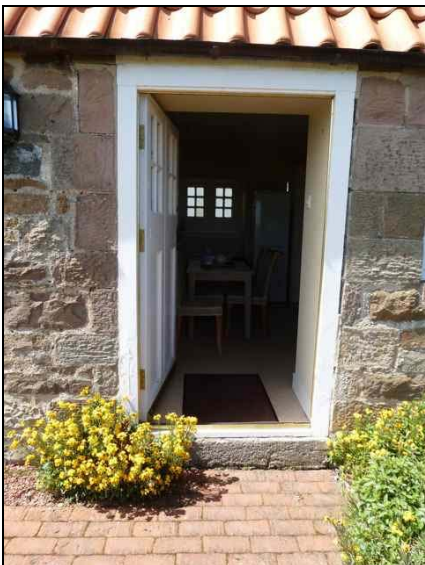
Back door with step