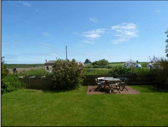
Garden at rear with views over to Castle