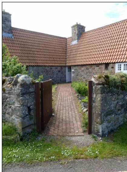
Approach to front door