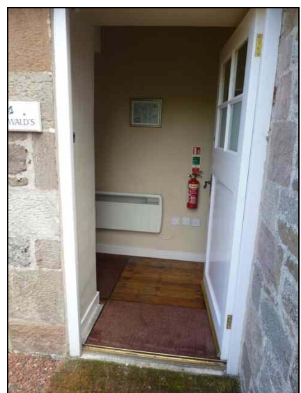
Front door (level access)