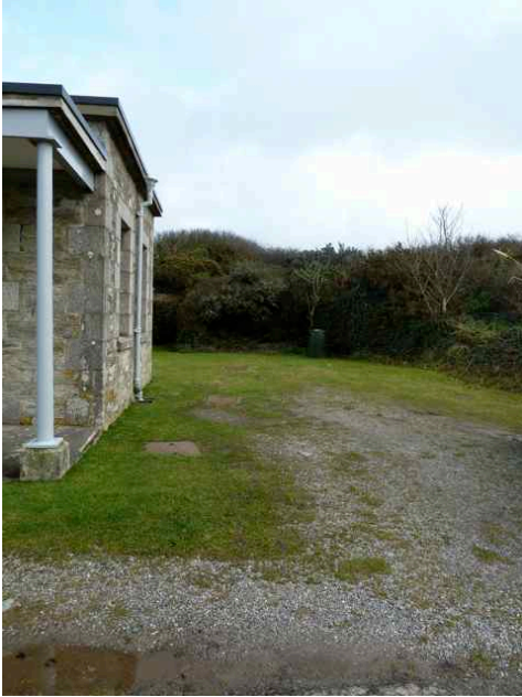
Car Parking area