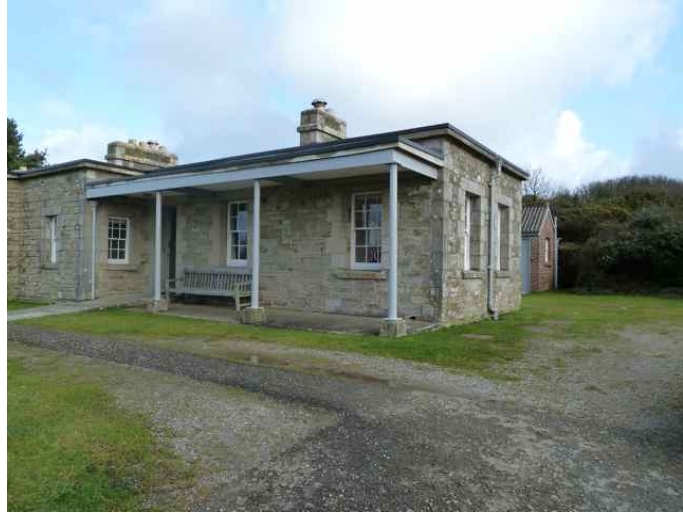
Parking area (to side) & route to front door