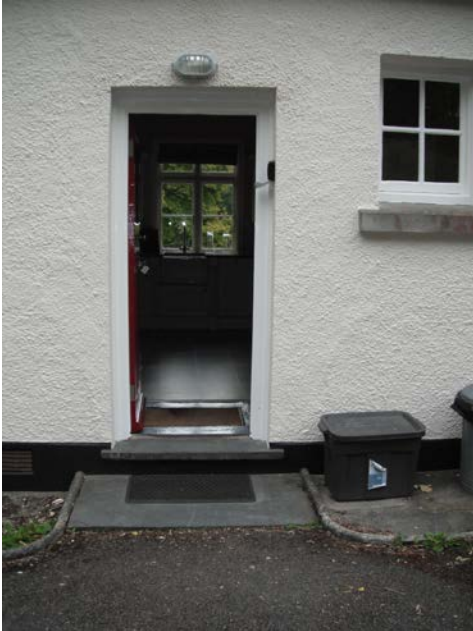
Main Entrance into kitchen