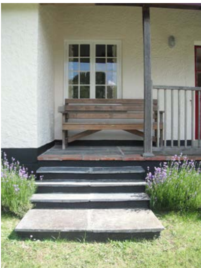
Entrance onto veranda to sitting room