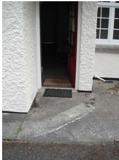
Entrance into hall