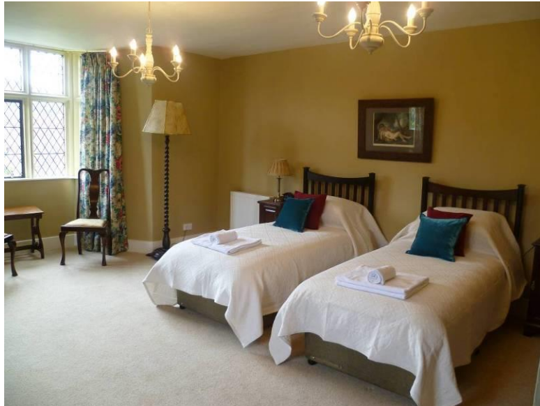
Large Double Bedroom – Can be Twin Beds on Request