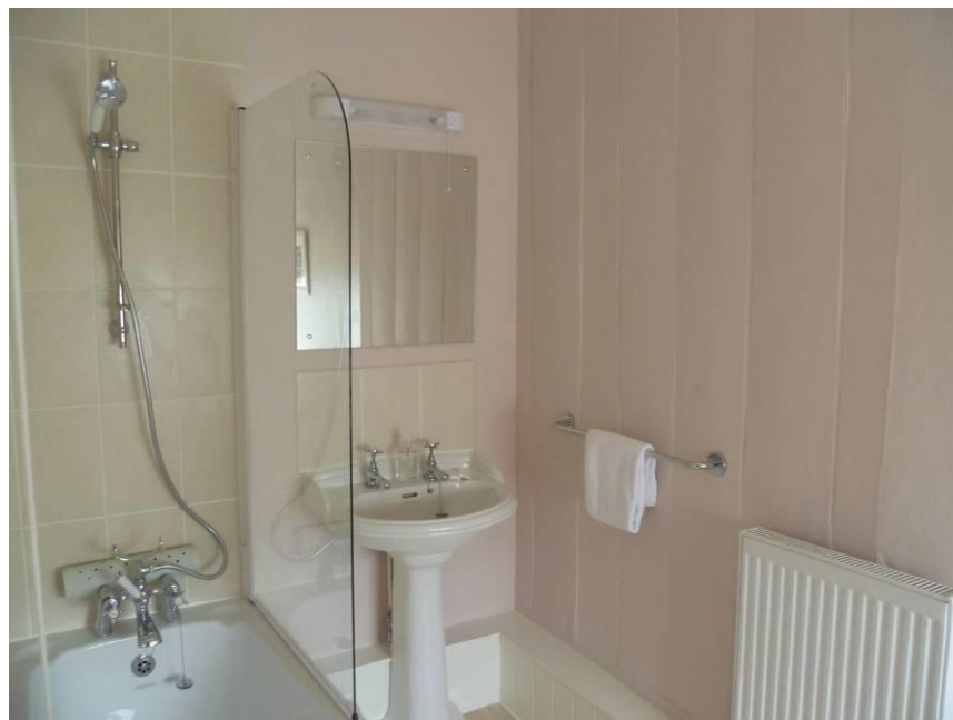
En-Suite Bathroom with Shower over bath