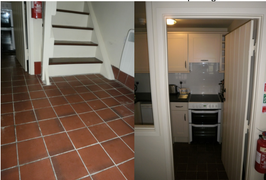
View showing flooring and stairs