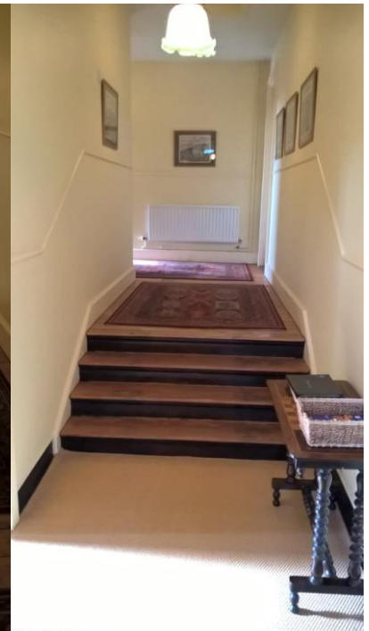
View from lower hall towards the front door