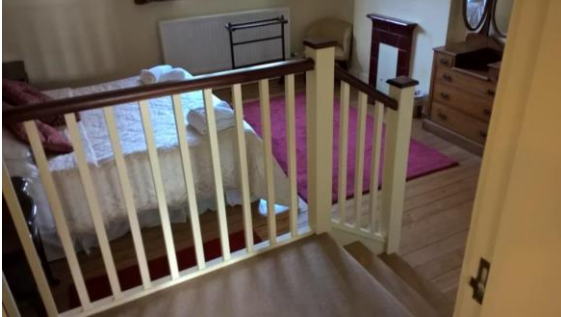
Steps down to the super king bedroom