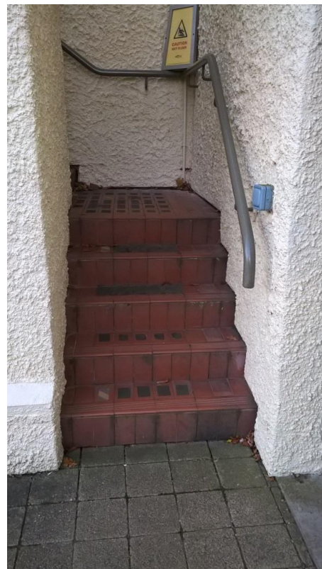
Exterior stairs up to the apartment