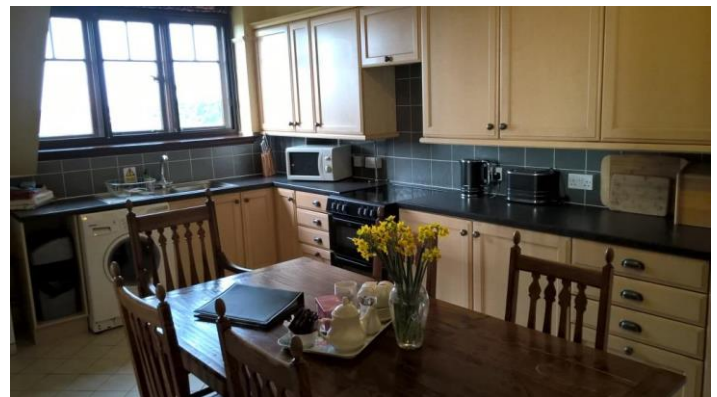
Kitchen / diner