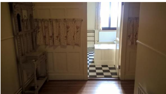
View from the front door towards the bathroom