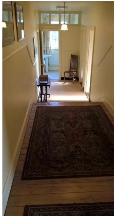
View down the hall from the front door towards the