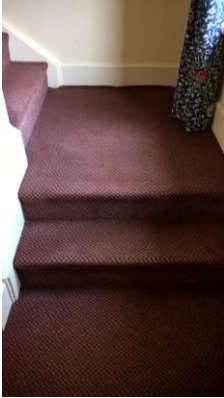
Internal staircase from the first floor to the second floor