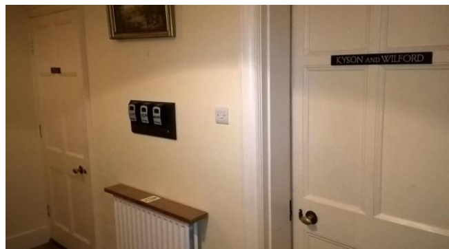
Keysafes on wall of communal first floor lobby; door to Kyson on right