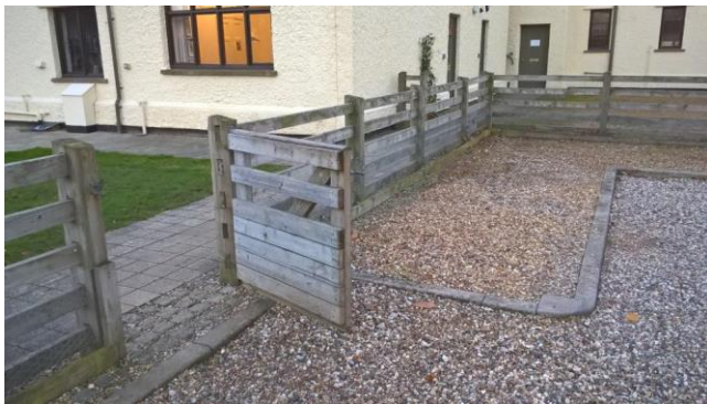
Gate from parking area to path to base of steps