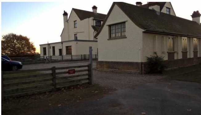
Entrance to gravel parking area by Tranmer House