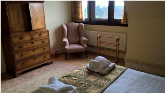
King size bedroom sloping roof can be seen to the right of the window