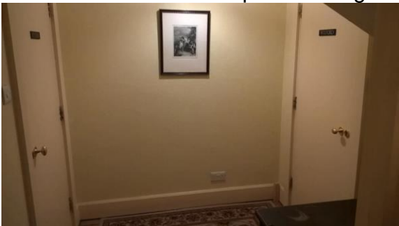
Main entrance to Kyson on left from communal second floor lobby