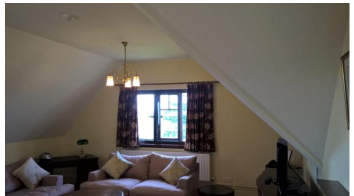
Detail of sloping ceilings in the sitting room