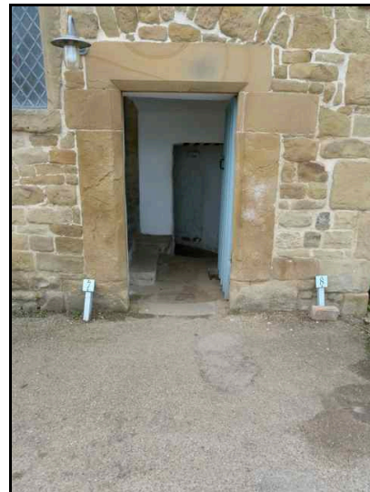
Entrance to Numbers 7 & 8