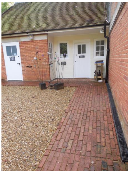
Brick path to Visitor reception entrance