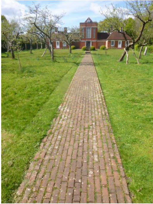
Path from road to front of chapel – 50m