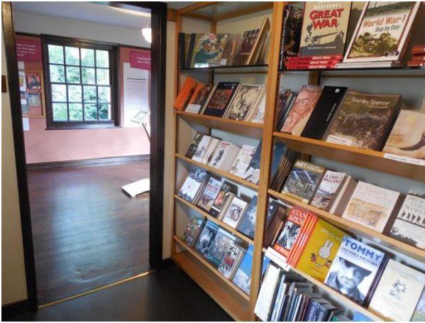
Visitor reception into first exhibition room.