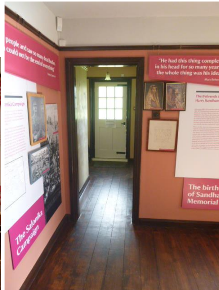
Corridor from main exhibition area