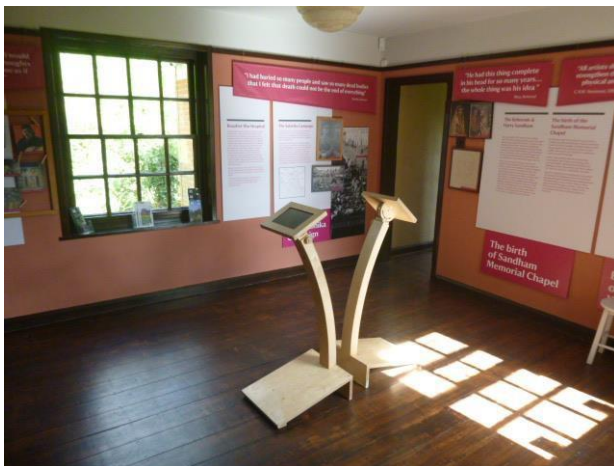
Main exhibition area