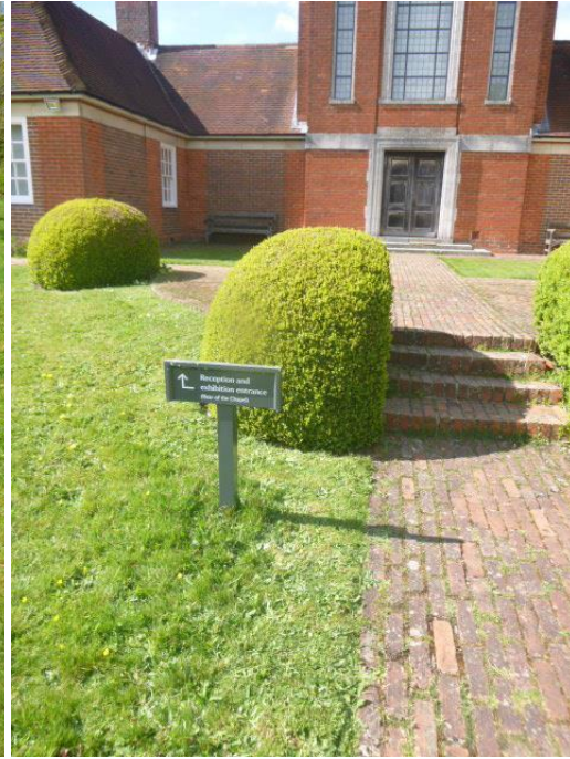
Steps at top of path.