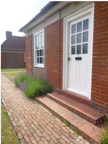
Exit from visitor reception via steps