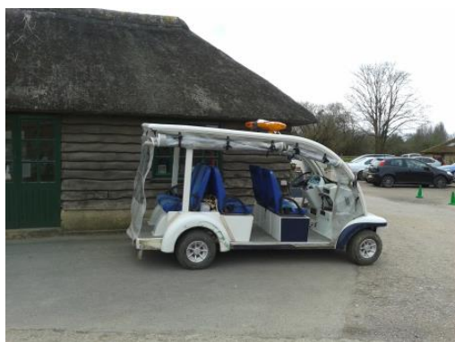
Six seater transfer vehicle - outside reception

Map - attached to the back of the statement