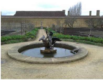
Pond in Kitchen Garden - unfenced water