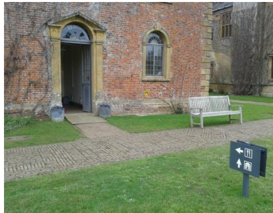
Entrance to Strode House – south lawn