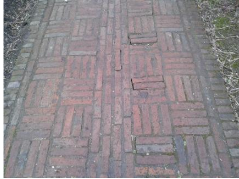
Uneven brick path in gardens