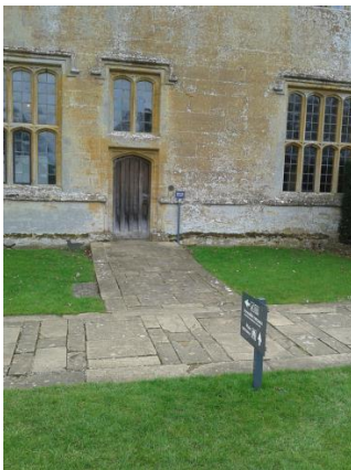
Accessible entrance to the Court House via east door