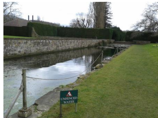
Moat on north side of Court House - unfenced water