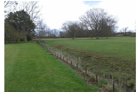
Ha-ha on south lawn – fenced ditch