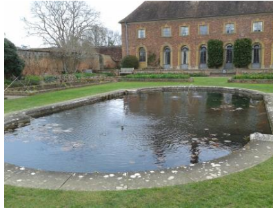
Pond in Lily Garden – unfenced water