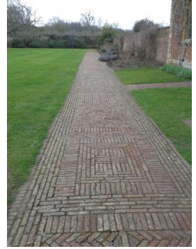
Stone path on south front