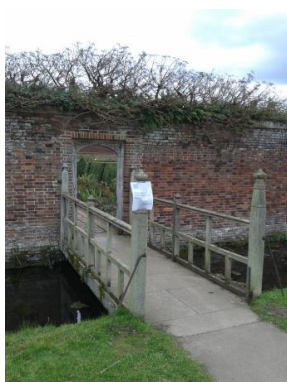
Entrance to the garden via bridge over moat - unfenced water