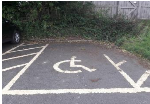
Disabled parking space