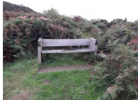
Sole wooden seat