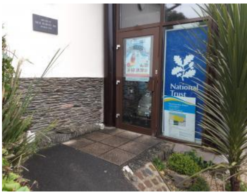
Rear entrance - level access