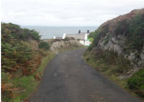
Last part of the route