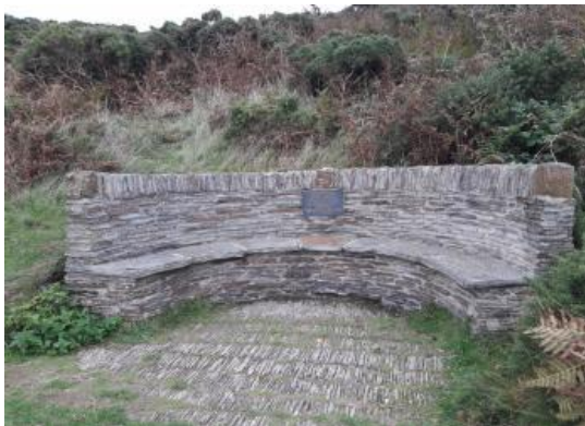
Seating with view near access gate