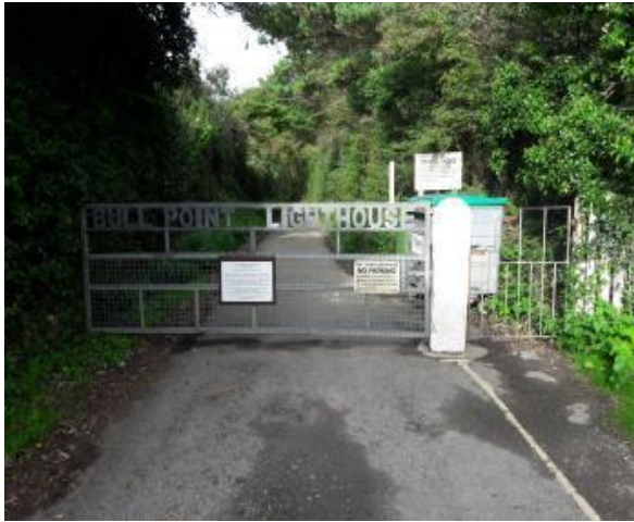
Gate with side access gate near start