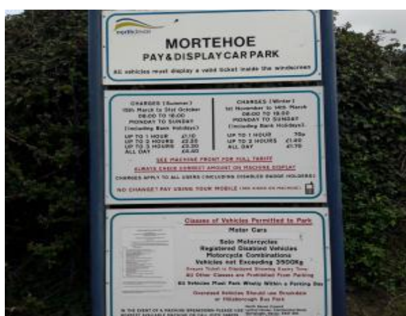
Summer and winter charges apply