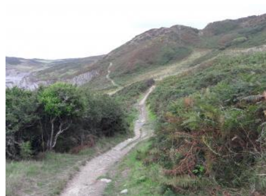
Coast path from Morte to Bull Point