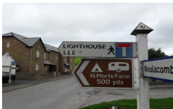
Sign to Lighthouse by car park