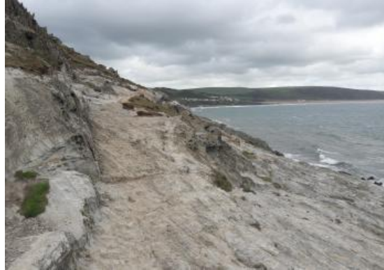
Rocky and uneven at Morte Point