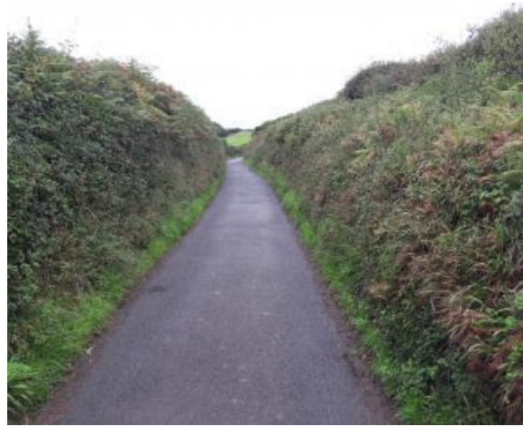
Part of the route