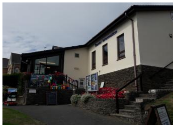
Tourist Information Centre