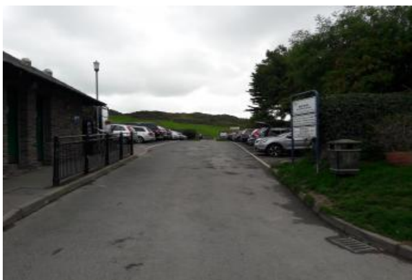
Entrance to car park