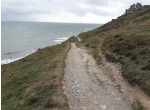
Route near Morte Point