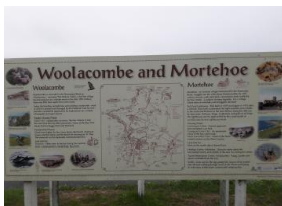
Information Board outside TIC