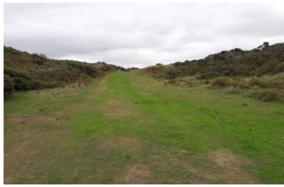
Early part of the route