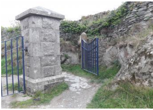
Gate near start of route