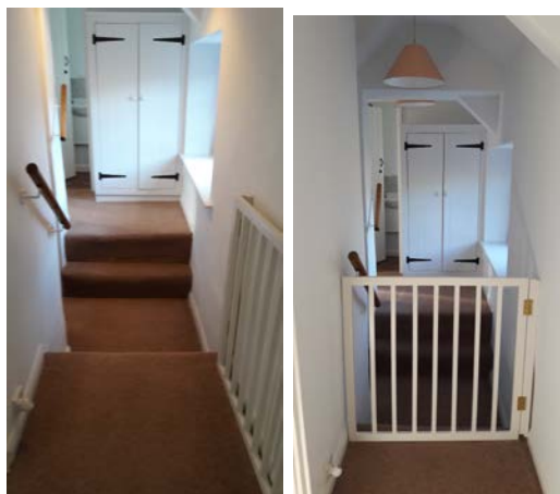
Landing towards WC