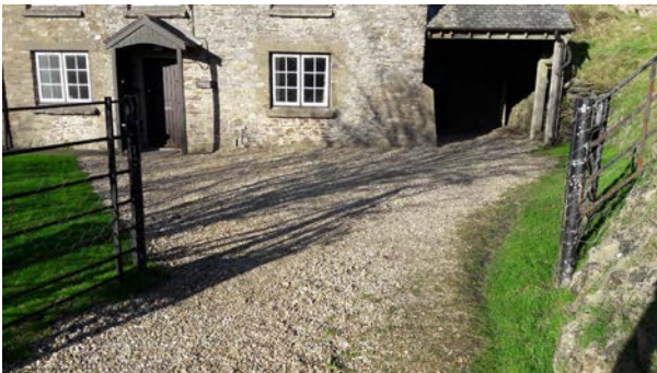
Entrance gate and parking area